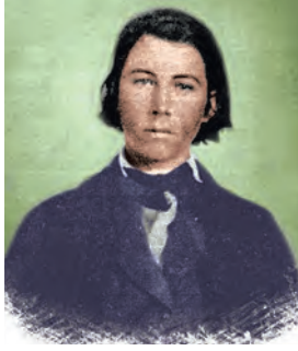
James Augustus Hickey

January 1780. It was named as 'Calcutta General Advertiser' or 'Bengal Gazette'. It was started by James Augustus Hickey, an Irish gentleman.